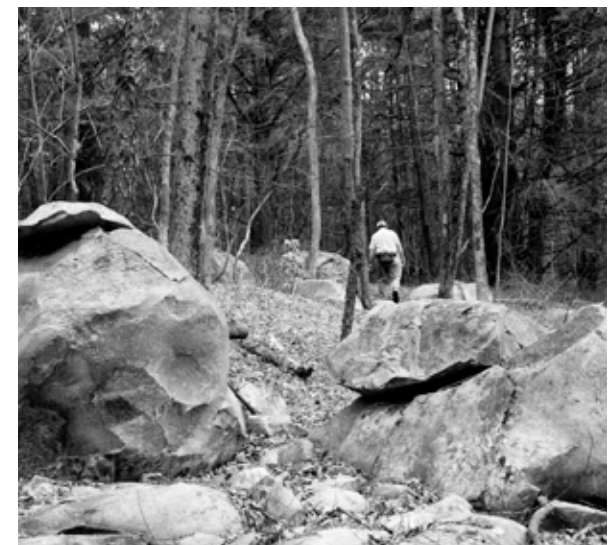
Historic information from Great Barrington: Great Town, Great History

Massachusetts Department of Conservation and Recreation 413.528.0904, www.mass.gov/dcr Berkshire Natural Resources Council 413.499.0596, www.bnrc.net Berkshire South Regional Community Center 413.528.2810, www.berkshiresouth.org